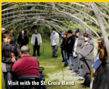
Visit with the St. Croix Band