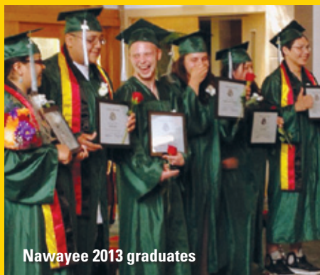
Nawayee 2013 graduates

Great things that happened during the 2013-14 school years: