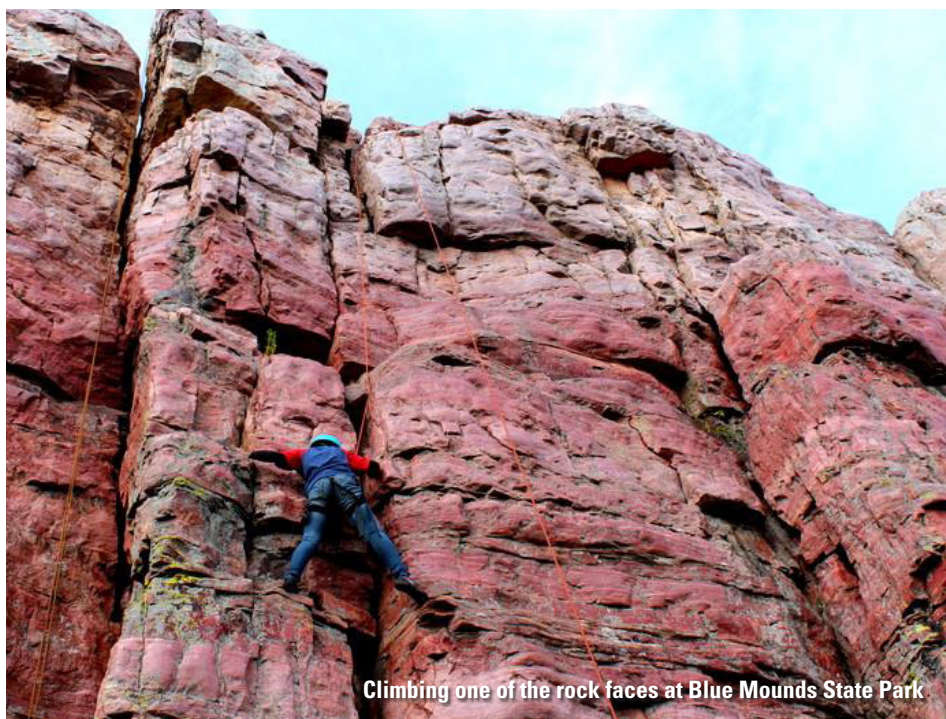
Climbing one of the rock faces at Blue Mounds State Park

During this process, our Board of Directors began creating a new strategic plan and interestingly it mirrored staff restructuring efforts so much that the staff and board arrived at the same conclusions. We mutually realized our need to trans-