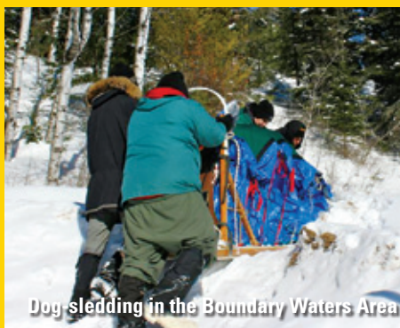
Dog sledding in the Boundary Waters Area

Our United Way-sponsored programming has successfully reduced teen pregnancy since its inception. We have experienced zero student pregnancies over the past three years only one in the past six years