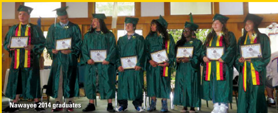
Nawayee 2014 graduates